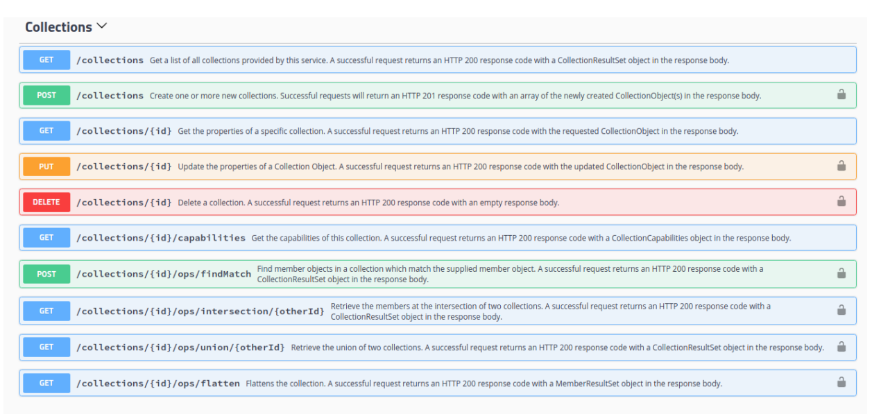
Figure 3: Screenshot of the Swagger UI view of the collections operations.