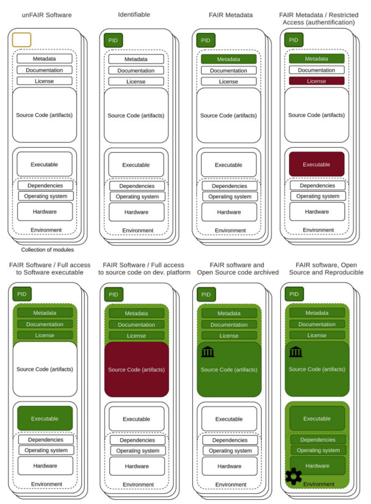
Figure 2: Summarizing software as increasingly FAIR research objects (Katz, Gruenpeter & Honeyman, 2021)