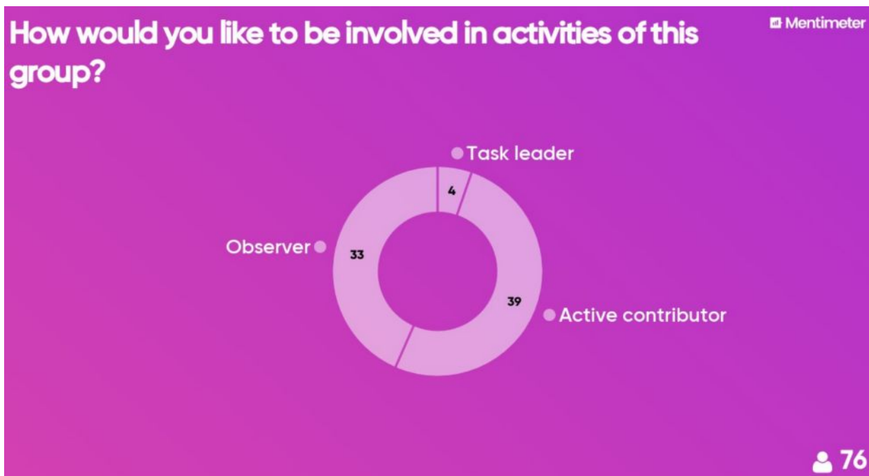
Fig.3. Interest in active contribution to the activities of the group expressed by the attendees of the 15 th RDA Virtual Plenary Birds of a Feather session (Mentimeter survey results).

In addition to coordinating with some of the existing RDA groups (as indicated in section 4), we will keep connections with existing initiatives and projects on professionalising data stewardship to reinforce each other, instead of repeating work. Over the last year, the potential co-chairs of the Interest Group have actively engaged with related initiatives, such as FAIRsFAIR, Terms4FAIRSkills, the EOSC pilot (FAIR4S), the Edison network, and the Dutch professionalising data stewardship project by ZonMw/NPOS (which is chaired by one of the potential co-chairs).