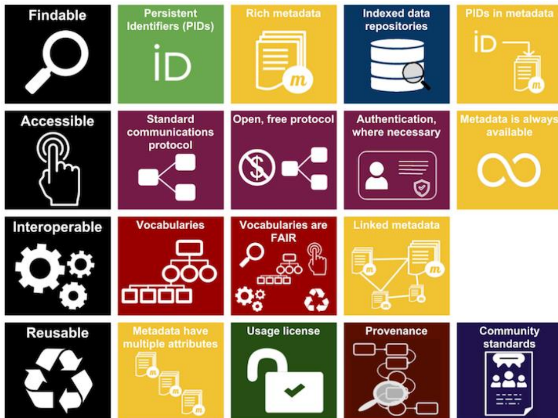
Figure 1; FAIR in a nutshell.

See ARDC image summarising what FAIR means; see also Force 11 definition.